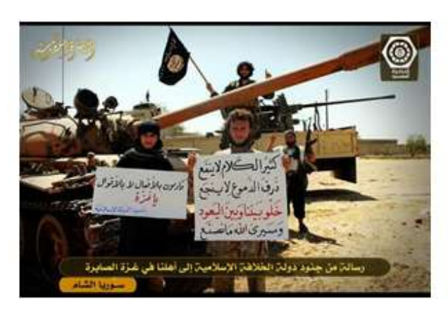
Daash militants in Syria waving banners in support of the residents of Gaza

Islamic State militants made do with holding signs that expressed support for the people of Gaza.<sup>5</sup> In the magazine, Dabiq, which was published in English by the ISIS at the end of July 2014, the editor devoted one paragraph to the war in Gaza and emphasized that the organization focused on actions, not words: "Its actions speak louder than its words and it is only a matter of time and patience before it reaches Palestine to fight the barbaric Jews and kill those of them hiding behind the gharqad trees - the trees of the Jews." In addition, the organization emphasized that it would fight against anyone who stands in the way of Palestine.<sup>6</sup>