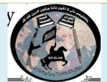
The Salafi Army of the Nation in Jerusalem (Palestinian)