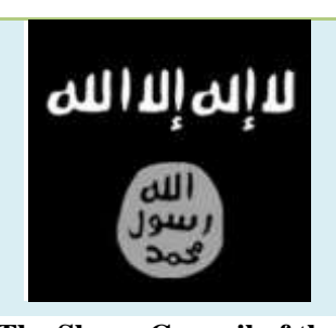
The Shura Council of the Mujahideen (Palestinian)

The list of prominent Salafi-jihadist organizations that claimed responsibility for the launch of missiles and rockets towards Israel during Operation "Protective Edge":