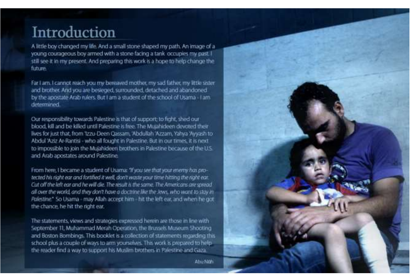
The editor's introduction to the new magazine

In effect, the new magazine is similar in appearance to the magazine, Inspire , which is also published by AQAP and aimed at Muslim communities in Western countries in order to promote individual jihad. The new magazine includes a collection of articles and speeches by senior jihadists, both living and dead, most of which were published in previous editions of Inspire and in other publications regarding the importance of the Palestinian problem. It also includes detailed and illustrated explanations that were published in previous editions of Inspire on how to build bombs and car bombs, among other things, in order to promote individual jihad against Israeli and American targets.<sup>9</sup>